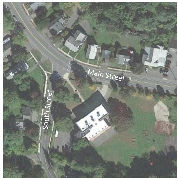
Existing Site – See next page for new Site Plan in progress

The team has kept a healthy pace and will continue to advance the design through the remainder of the summer months. Although more discussions need to be had regarding actual construction timeline, we anticipate that solicitations for demolition and new construction bids will be ready to publish by the end of 2021, early 2022. Further details regarding the anticipated schedule will be available in the next newsletter publication.